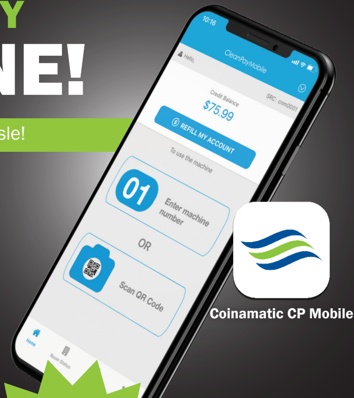
Coinamatic CP Mobile

Download the app AND add funds TO RECEIVE A FREE WASH AND DRY!