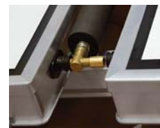
Push second collector into the connectors