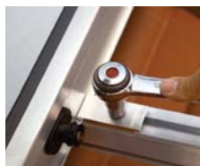
Site and secure the first collector