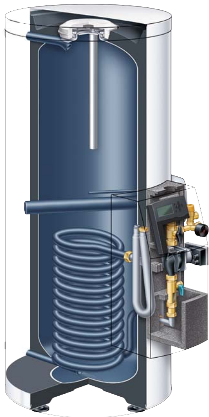
*Vitocell 100-W, CVSA with backup electric element

On the dual mode hot water tank, the factory-mounted Solar-Divicon includes the pre-wired solar control unit for the solar circuit, 3 speed solar circuit pump, flow meter, air separator, fill and drain assembly pressure gage and relief valve. Everything needed for the solar circuit with no assembly required. Highly efficient all-round thermal insulation reduces heat losses from the hot water tank and the pumping station.