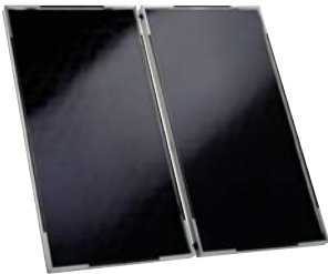
Single collector Vitosol 200-F (type SVK)