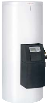
Vitocell 100-W with Solar-Divicon